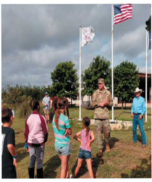
A Camp for Children (Ages 8 - 15) of Active Duty Service Members and Veterans of all Military Branches